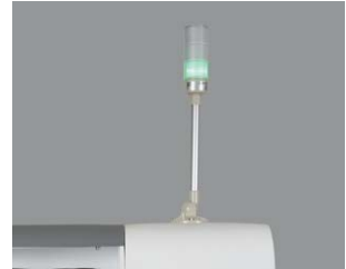
3 Lights Signal Beacon