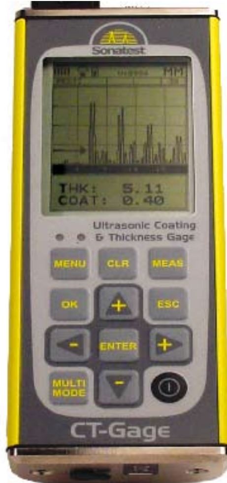
A-Scan Display (DL+)

The CT-Gage DL+ enables A-Scan measurements to be taken and stored. This model also includes Time Corrected Gain features.